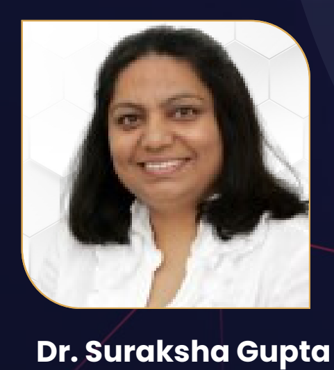
Newcastle University, London UK